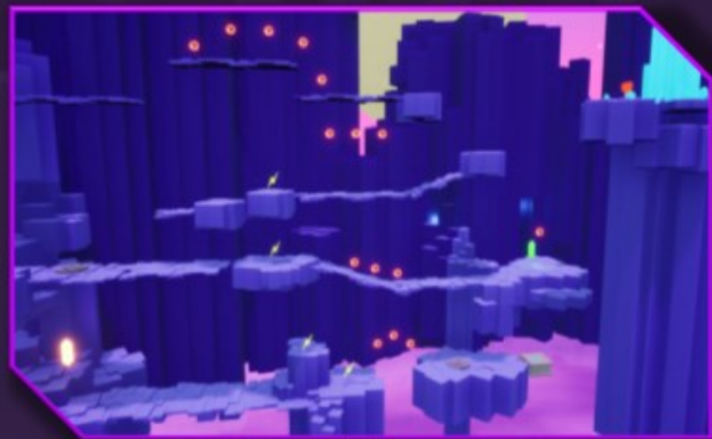
Theme 1 - Cave

Currently we have 2 different themes for our levels. New themes will be added shortly.