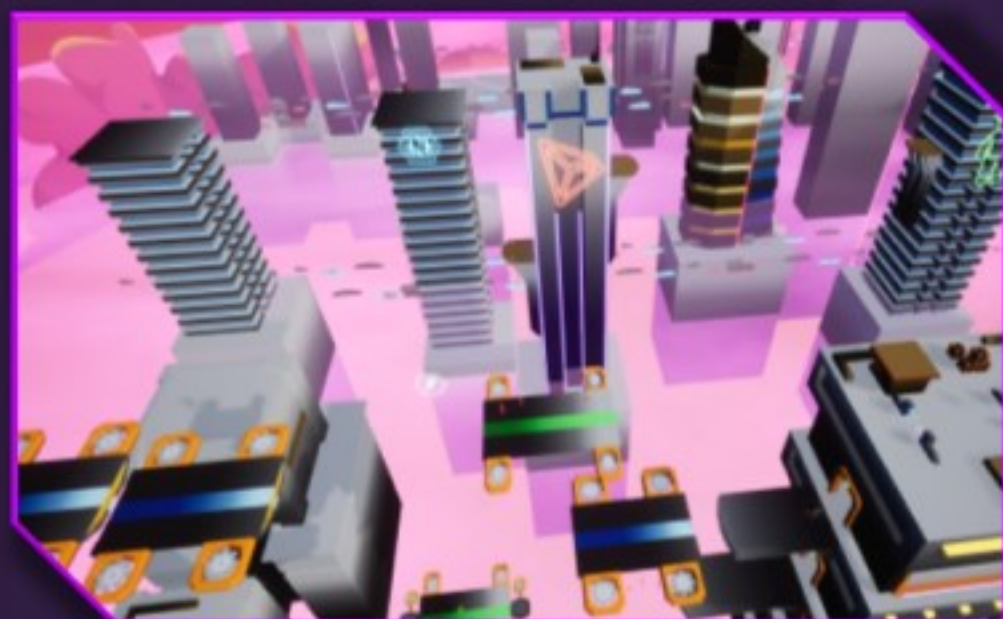
Theme 2 - Futuristic City